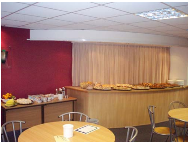
The famous Woodward Buffet