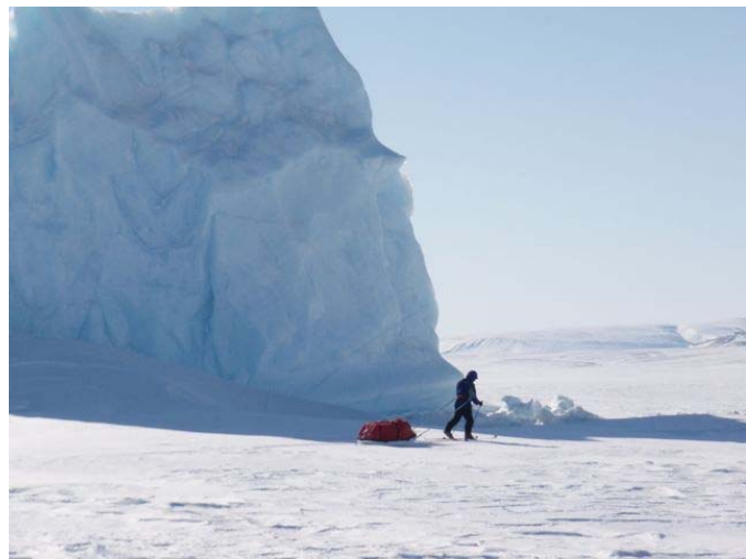
Our past student – Phil Poole

I was cold and numb after 5 hours on the back of the skidoo racing across the sea ice at speeds of up to 90 kph. Ahead, were my clients, excited at the prospect of ski-ing and climbing in an unexplored region of the East Greenland coast. I somehow trusted their Inuit drivers; mine I was not so sure about, he was not local and kept veering towards holes and cracks in the ice. I don't like being out of control.